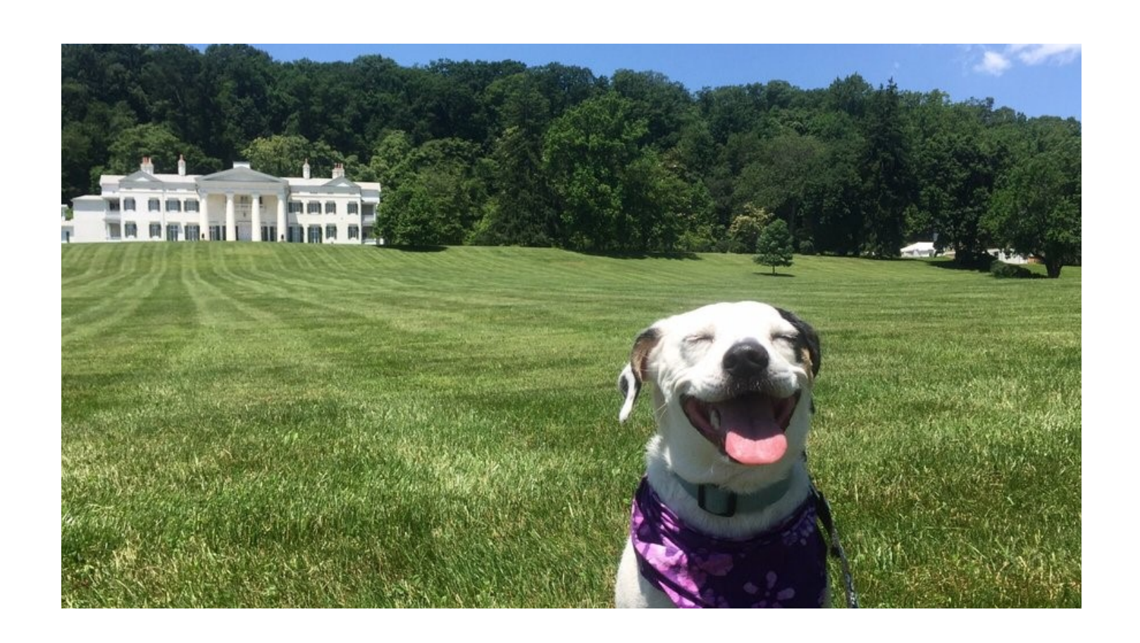
Buildings & Grounds Keeping Morven Park. Beautiful

10,000 acres of grass mowed 2,500 flower bulbs planted 250 damaged trees removed 50 new stall doors built 4 miles of fence painted $0 of government funding