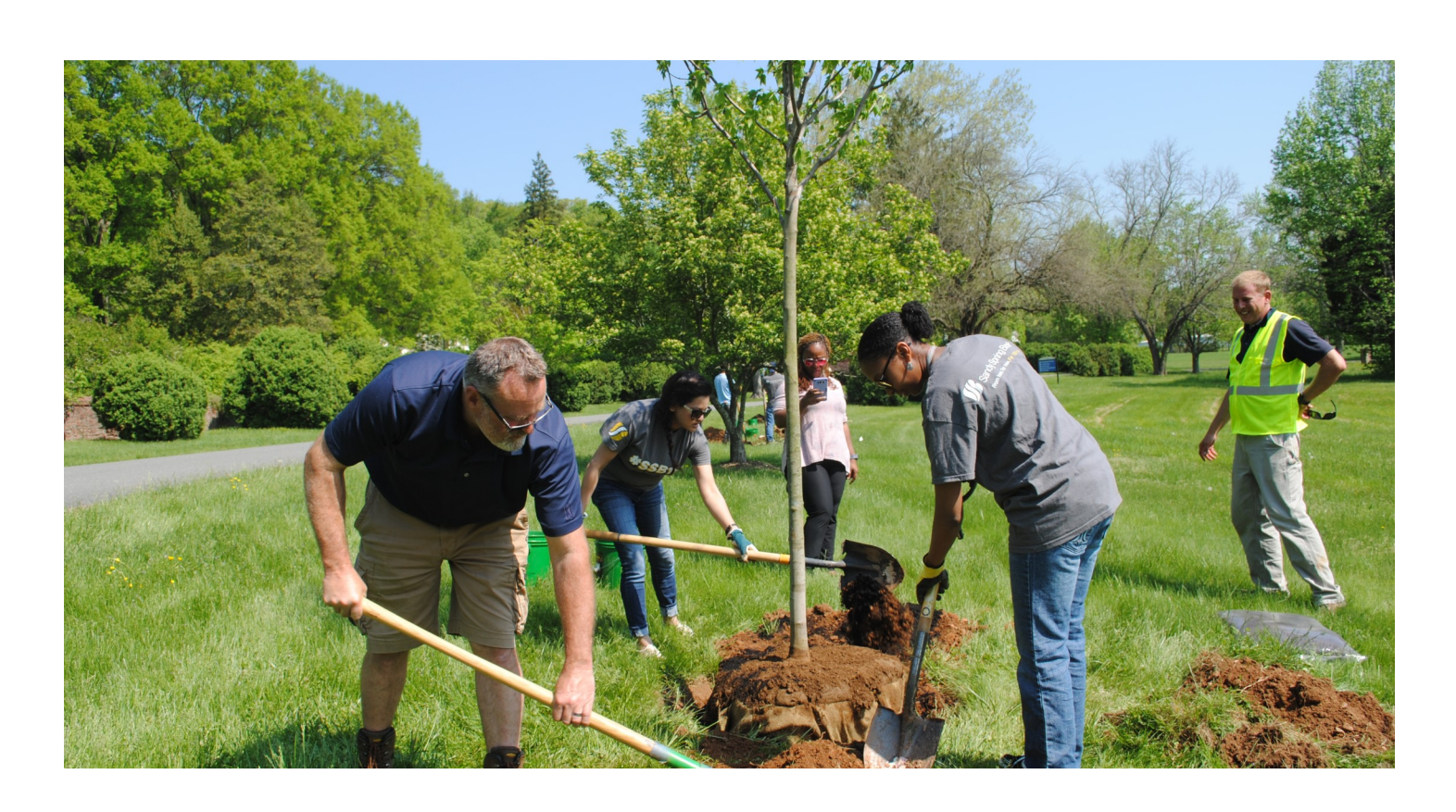
Volunteers Make it Happen at Morven Park The MVP program had a successful second year in 2018