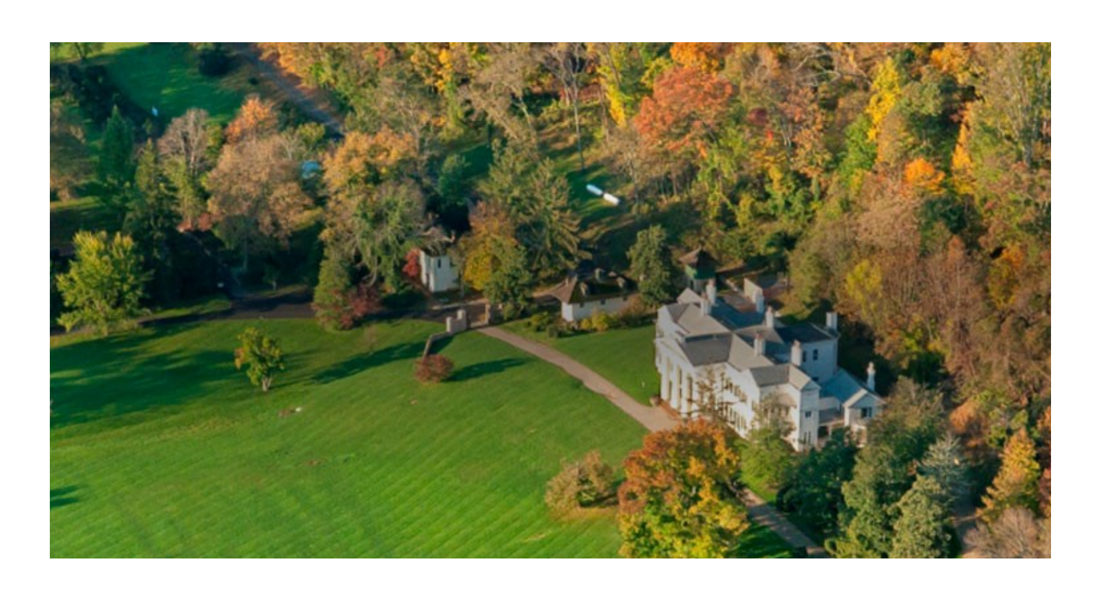
Museums and Preservation Preserving the past for future generations